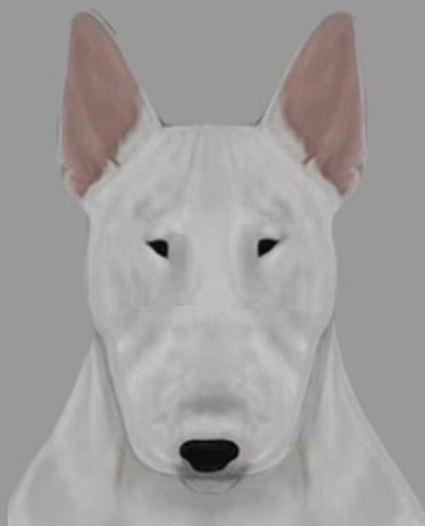
Incorrect--set too close