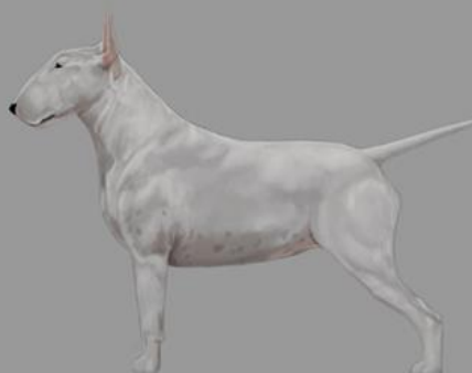
Incorrect-over angulated (too long lower thigh)