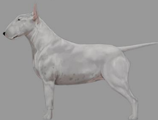
Correct correct length and carriage