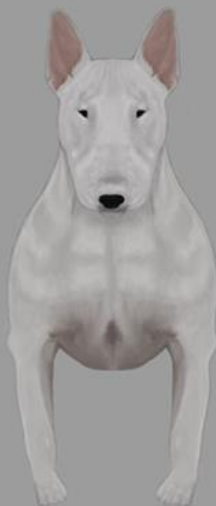
Feet tend to turn inwards , overly loose elbow