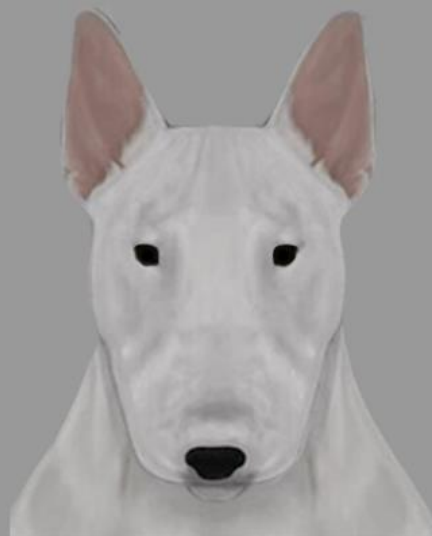
Incorrect- round eyes