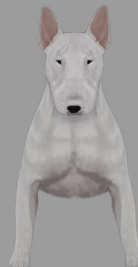
A-Frame (restricted shoulders)