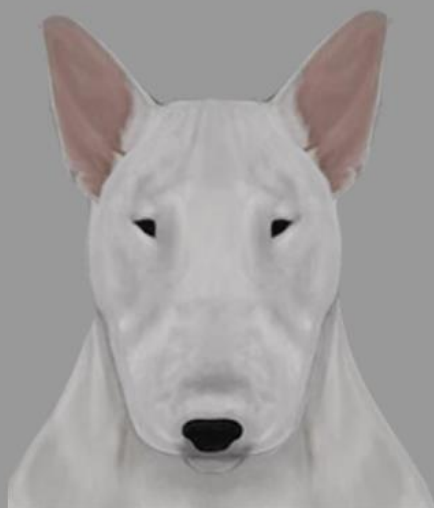
Incorrect--set down and to wide