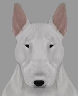
Incorrect-cheeks too strong