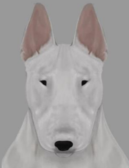
Incorrect-set too close