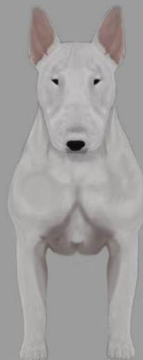
Cathedral (narrow concav front)