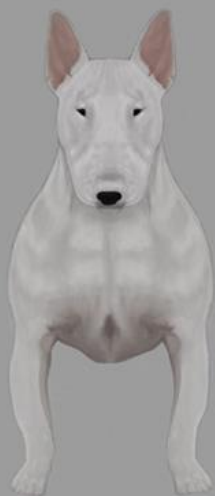
Bowed front legs east west feet