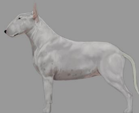
Set too low and long